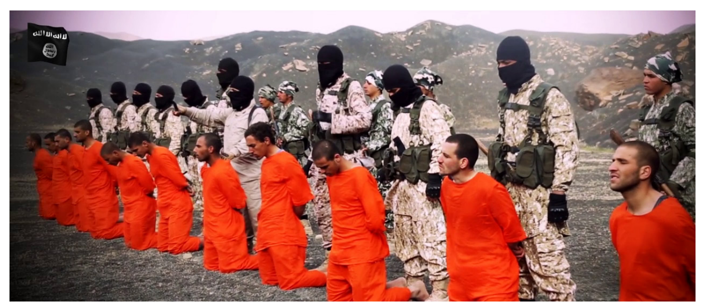
Image captured from a video produced by "Wilayat Damascus" on June 25, 2015, and entitled "Repent before We Overcome You," which shows the Islamic State executing Jaysh al-Islam fighters.

or organization." Yet, the future leaders of the Islamic State, the successors of AQI, practiced exactly what he cautioned against. What explains this failure to learn from history, and what are the implications for countering similar movements in the future—other than to stand out of the way as they shoot themselves in the foot again?