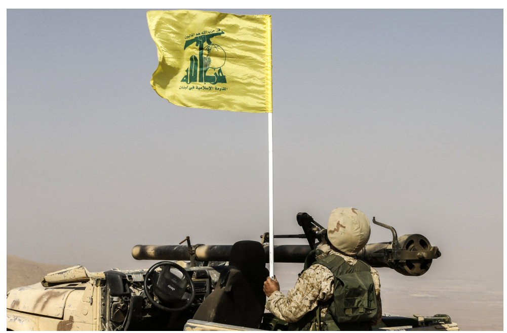
A photo taken on August 2, 2017, during a tour guided by the Lebanese Hezbollah group shows a fighter flying the group's flag in the vicinity of the Syrian town of Flita near the border with Lebanon.

its expeditionary units headed to Syria, consisted of Iraqi Shi`a and deployed throughout Syria in varying capacities. <sup>16</sup> Groups like Badr also helped to train Syrian Shi`a militias, transforming them into mobile rapid response units, modeled on smaller versions of Lebanese Hezbollah. <sup>17</sup>