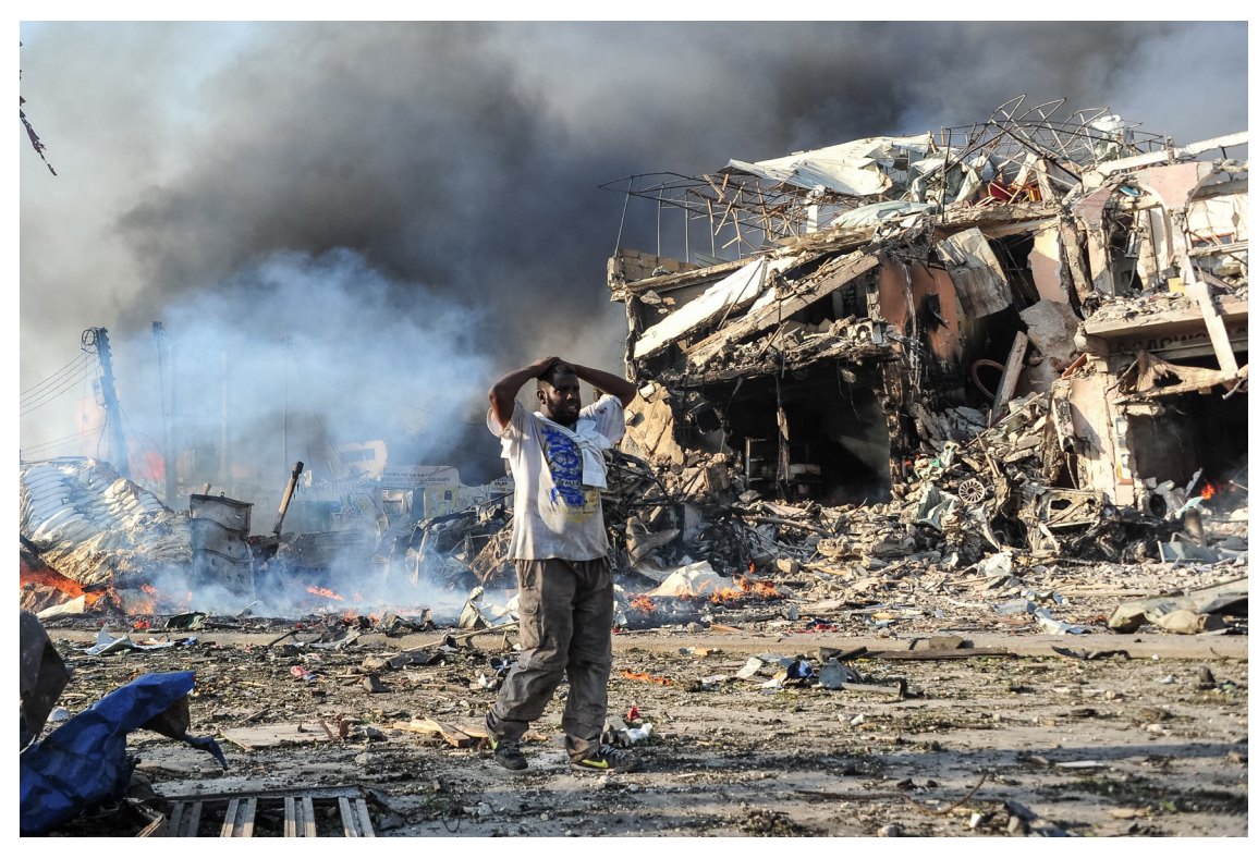
A Somali man reacts at the site of a double-truck bombing at the center of Mogadishu, Somalia, on October 14, 2017, which killed at least 350 people.

34 CTC SENTINEL NOVEMBER 2017 MUIBU / NICKELS